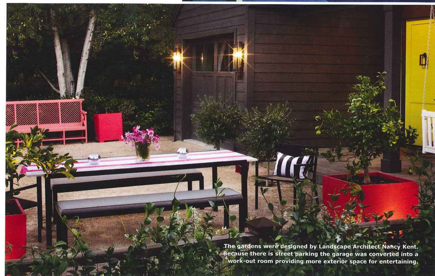
The gardens were designed by Landscape Architect Nancy Kent. Because there is street parking the garage was converted into a work-out room providing more exterior space for entertaining.